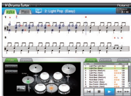
■ Notation Screen