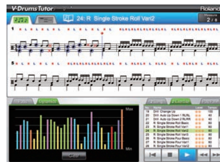
■ Dynamic Bar Graph