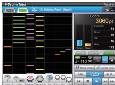
■ Game Screen