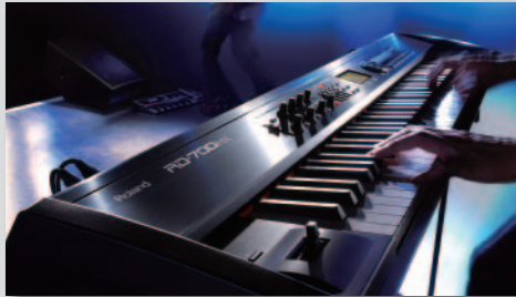
RD-700NX Version 2