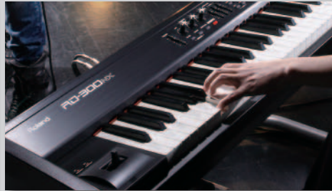
RD-300NX Version 2