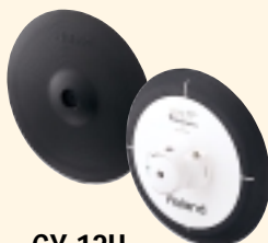
CY-12H V-Cymbal Hi-Hat