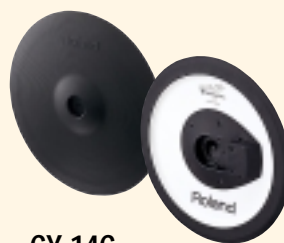
CY-14C V-Cymbal Crash