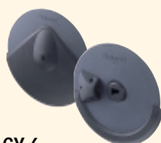
CY-6 Dual-Trigger Cymbal Pad