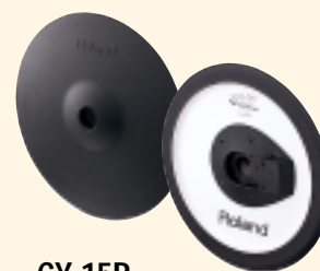
CY-15R V-Cymbal Ride